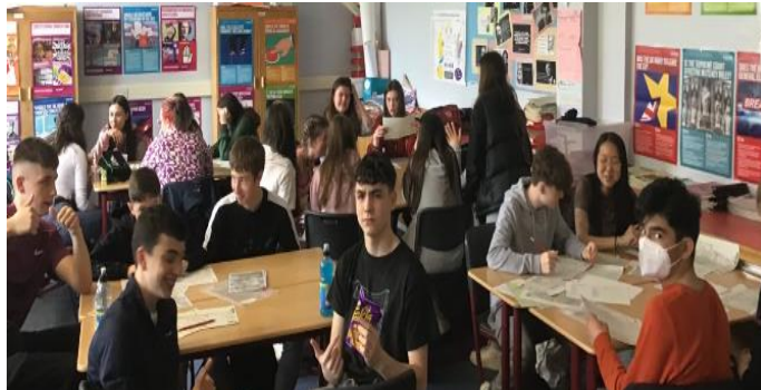
Navigation and Route Planning