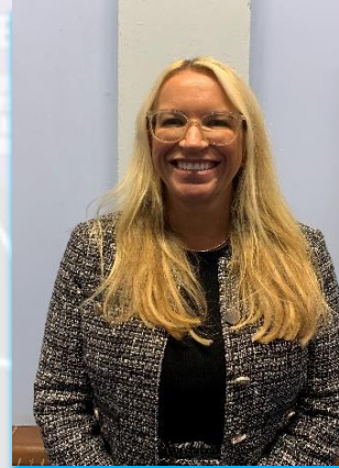
Ms Black Lomond House