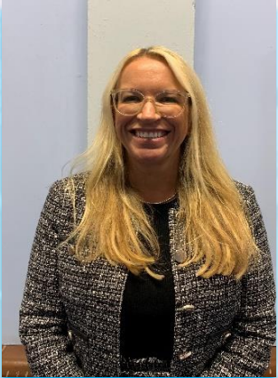
Ms Black Lomond House