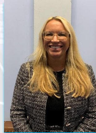
Ms Black Lomond House